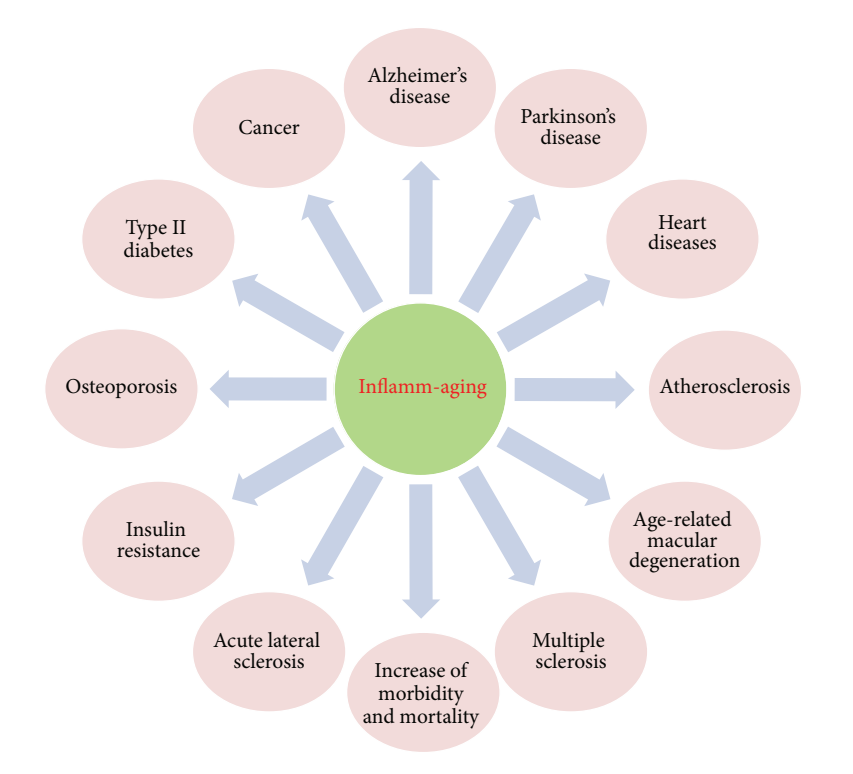
FIGURE 1: The relationship between inflamm-aging and diseases.

proinflammatory status in healthy persons and centenarians show a beneficial response that helps the elderly deal with the stimuli generated by chronic antigen stressors [19]. However, excessive stress response, as well as an accompanying increasingly high proinflammatory response, leads to human inflamm-aging.